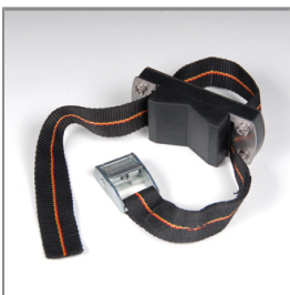
Ordering Code: AUN-TRS-0001-00 Tree strap, small mounting base