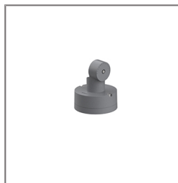
Ordering Code: AUN-MOT-0021-XX Mounting base, rotateable, On-Off, pre-assembly from factory