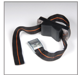
Ordering Code: AUN-TRS-0001-00 Tree strap, small mounting base