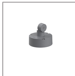
Ordering Code: AUN-MOT-0022-XX Mounting base, rotateable, 1-10V or DALI, pre-assembly from factory