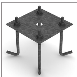
Ordering Code: AUN-ACB-0008-00 Anchor bolt kit, pole diameter 102mm and 151x102mm, galvanized steel pole