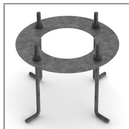
Ordering Code: AUN-ACB-0005-00 Anchor bolt kit, aluminum pole