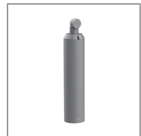
Ordering Code: AUN-POL-0044-XX Cylindrical aluminum pole, diameter 105mm, H= 522mm, 1-10V / DALI [pre-assembled from factory]

*Due to the constancy of product development, we reserve the right to alter all specification without prior notice.