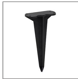
Ordering Code: AUN-ESP-0001-00 Earth spike, GFR polymer