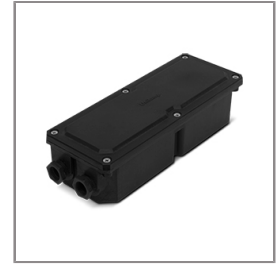
Ordering Code: AUN-DRG-0006-01 LED constant current driver, 1050mA, 38W, with IP67 GFR polymer enclosure, DALI