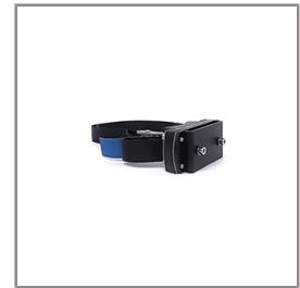
Ordering Code: AUN-TRS-0005-00 Tree Strap.