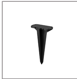
Ordering Code: AUN-ESP-0005-00 Glass-Fiber Reinforced Polymer Earth Spike.