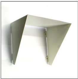
Ordering Code: AUN-GHS-0015-XX Glare Shield Cap