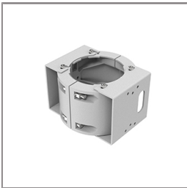
Ordering Code: AUN-CLP-0004-XX Pole clamp, pole diameter 102-105mm