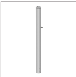
Ordering Code: AUN-POL-0025-XX Pole array for 2 projector