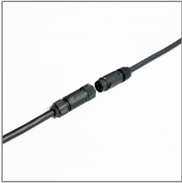
Ordering Code: AUN-CON-0011-00 IP68 connection device, cable diameter 7.1-13mm, 1-10V or DALI