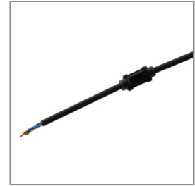
Ordering Code: AUN-CAB-0003-00 Cable 3x1sqmm and 2x0.35sqmm, L= 2000, with UniBlock anti-humidity kit, pre-assembly from factory