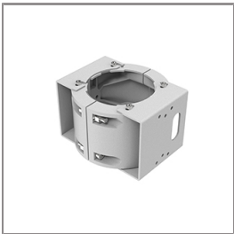
Ordering Code: AUN-CLP-0004-XX Pole clamp, pole diameter 102-105mm