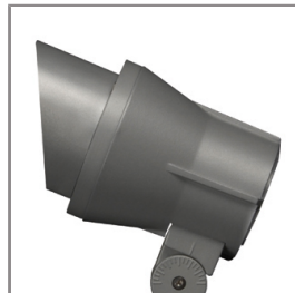
Ordering Code: AUN-GHS-0002-XX Glare shield cap