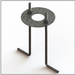
Ordering Code: AUN-ACB-0014-00 Anchor bolt kit, bollard