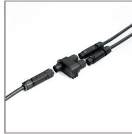
Ordering Code: AUN-CON-0010-00 IP68 connection device 3 pole, cable diameter 5-9.5mm, with distribution block