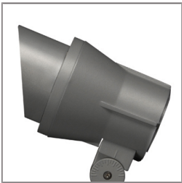
Ordering Code: AUN-GHS-0001-XX Glare shield cap

*Due to the constancy of product development, we reserve the right to alter all specification without prior notice.