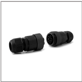
Ordering Code: AUN-CON-0014-00 IP68 connection device, cable diameter 8-12.5mm, 1-10V or DALI