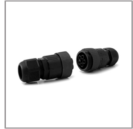
Ordering Code: AUN-CON-0014-00 IP68 Water Tight Connecting Device 5 Pole, Cable Diameter 8 – 12.5mm. [1-10V or DALI]