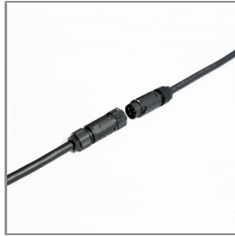
Ordering Code: AUN-CON-0011-00 IP68 Water Tight Connecting Device 5 Pole, Cable Diameter 7.1 – 13mm. [1-10V or Dali]