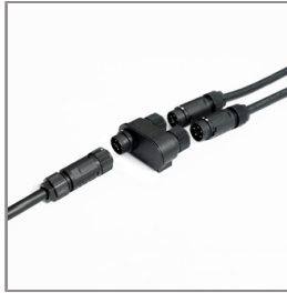
Ordering Code: AUN-CON-0012-00 IP68 connection device 5 pole, cable diameter 7.1-13mm, with distribution block, 1-10V or DALI