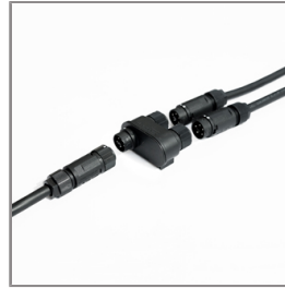
Ordering Code: AUN-CON-0012-00 IP68 connection device 5 pole, cable diameter 7.1-13mm, with distribution block , 1-10V or DALI