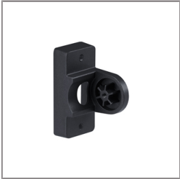
Ordering Code: AUN-MOT-0008-XX Pole mount adaptor, rectangular pole