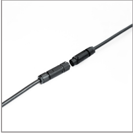
Ordering Code: AUN-CON-0009-00 IP68 connection device, cable diameter 5-9.5mm, On-Off