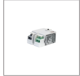
Ordering Code: AUN-SEN-0001-00 Photocell, On-Off, pre-assembly from factory