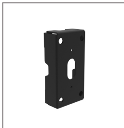
Ordering Code: AUN-MOT-0012-XX Wall spacer