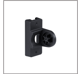
Ordering Code: AUN-MOT-0011-XX Pole mount adaptor for pole dia 102-105mm.