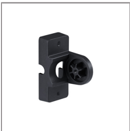
Ordering Code: AUN-RCH-0012-XX Mounting base, rotateable