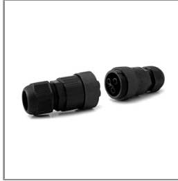
Ordering Code: AUN-CON-0013-00 IP68 connection device, cable diameter 7-11.5mm, On-Off