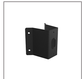
Ordering Code: AUN-BRK-0002-XX Corner mounting bracket