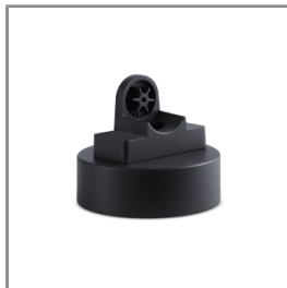
Ordering Code: AUN-MOT-0020-XX Mounting base, rotateable